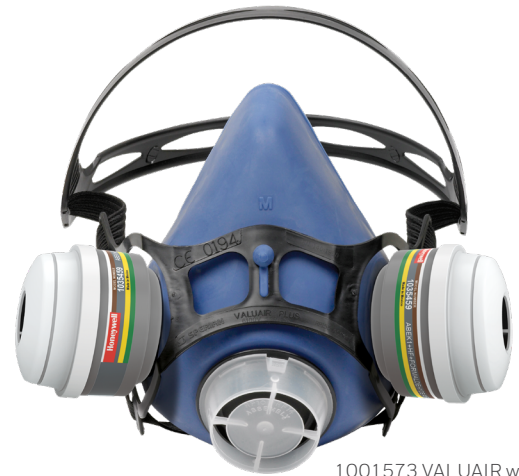
1001573 VALUAIR with 1035459 cartridges

The N-series bayonet cartridges are 20% lighter and 12% shorter in diameter than the T-series, and bring increased comfort for the wearer. Plus, they will offer optimal protection against many hazardous gases and vapors across applications, including use in explosive working environments.